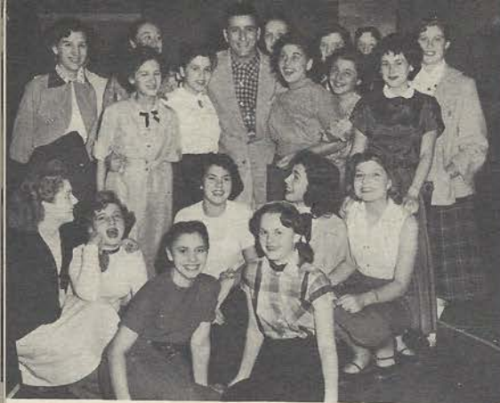
One of his first fan club meetings