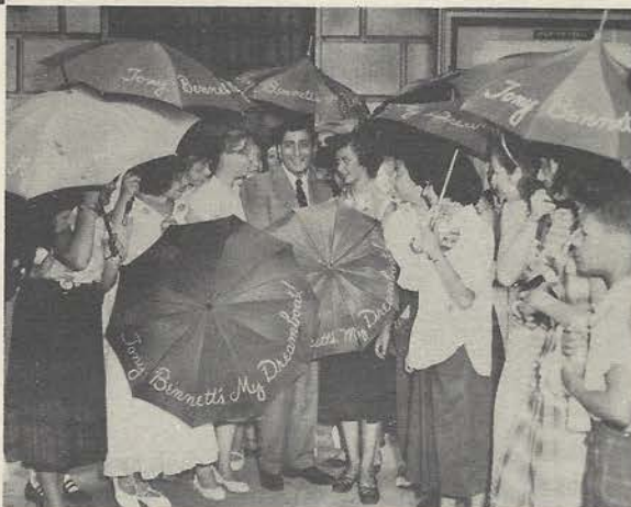
Another early fan club