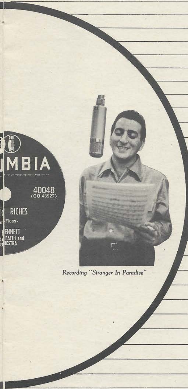
Recording "Stranger In Paradise"

(Now available at your local record dealer)