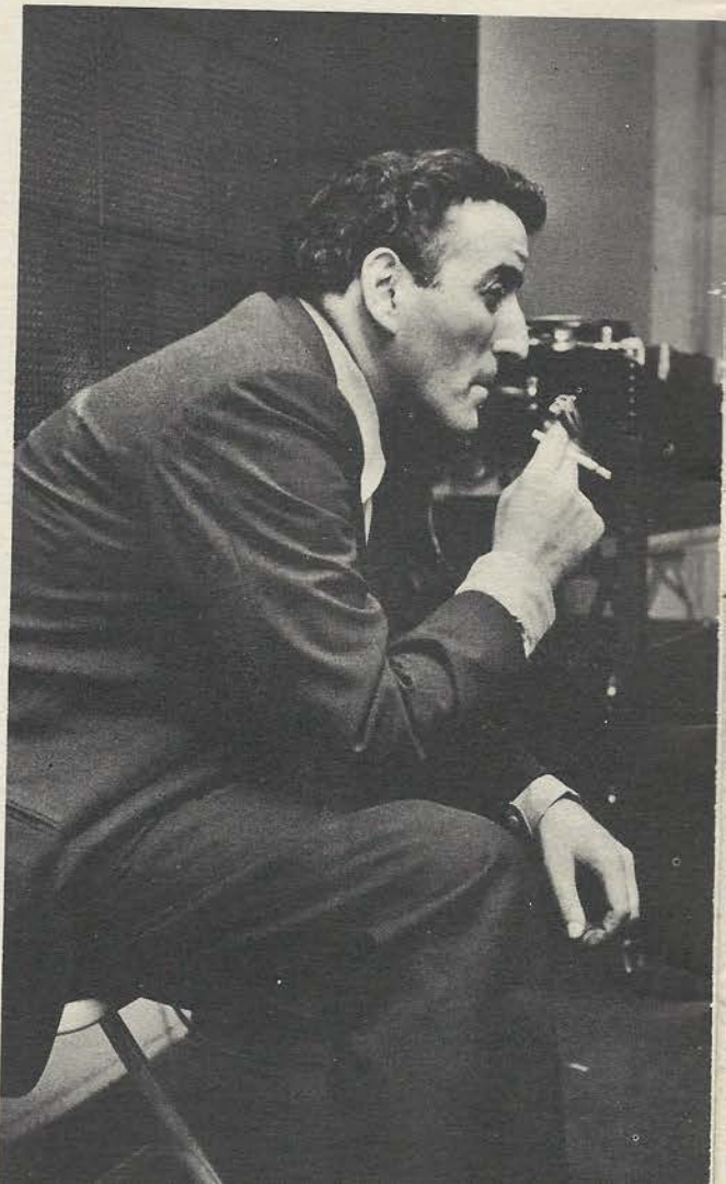
The play back