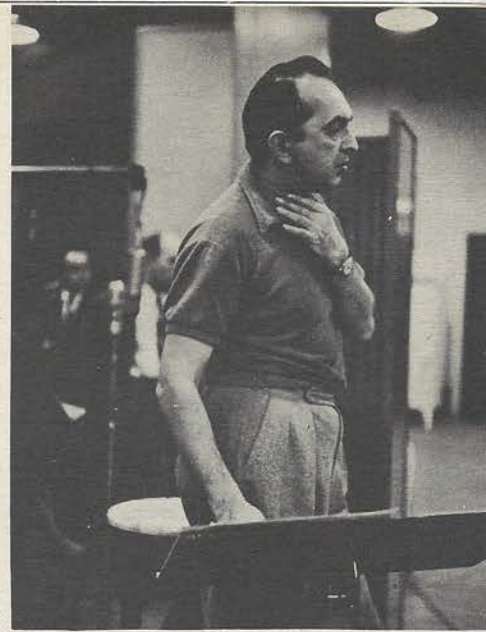
Getting ready to start