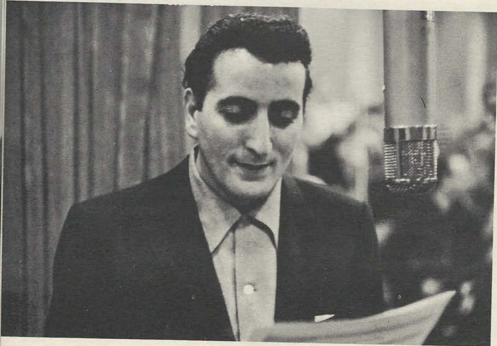
Waiting for the starting light