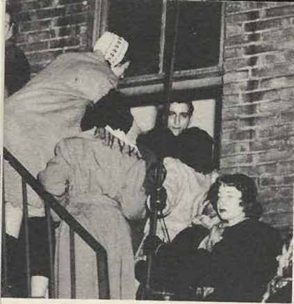
He had trouble leaving the Seville, Montreal