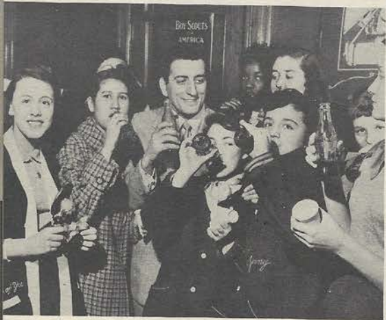
With fans after being photographed by them