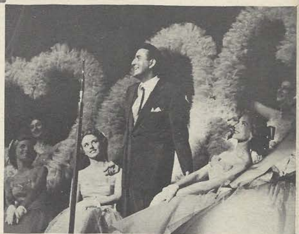
At The Roxy