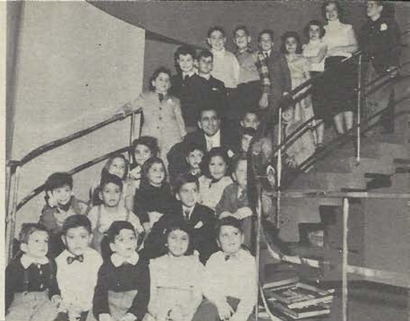
Surrounded by young fans