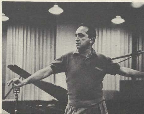
OK — Press it!